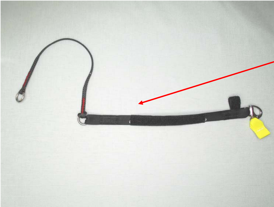
Original RSL for “Reserve Boost” on Wings Reserve Containers.